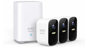
Human Detection Reduces False Alert

Anker T88323D2. Posizionamento supportato: Interno e esterno, Tecnologia di connessione: Wireless. Tipo di montaggio: Parete, Colore del prodotto: Bianco, Fattore di forma: Scatola. Angolo di campo visivo: 135°. Modalità video supportate: 1080p. Sistema audio: 2-vie