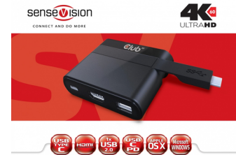
USB Type-C to HDMI™ 2.0 + USB 2.0 + USB Type-C Charging Mini Dock