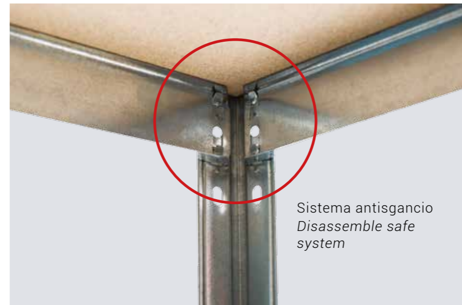
Sistema antigancio Disassemble safe system

* portata per ripiano, peso uniformemente distribuito shelves capacity with an evenly distributed weight