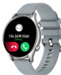
TASTIERA TELEFONICA TOUCH